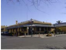
Woolshed Hotel Bordertown 08 875 1144