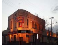
Prince of Wales Hotel Port Road Queenstown 8447 1252