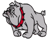
SLUM DOGS Bulldogs Past supporting Bulldogs Present

Knowledge is knowing a tomato is a fruit; Wisdom is not putting it in a fruit salad.